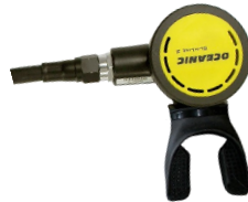
SL2 Second Stage Slim line regulator with 90° swivel Banjo hose. Also available in full black color