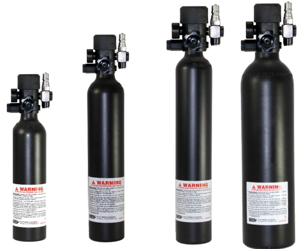
1.5 cu.ft. 2.0 cu.ft. 2.5 cu.ft. 6.0 cu.ft.