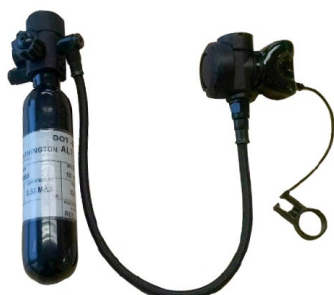
2.58 cu. ft. / 73.02 l