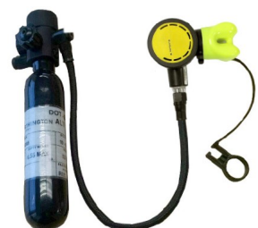
2.58 cu. ft. / 73.02 l