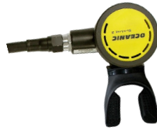
SL2 Second Stage Slim line regulator with 90° swivel Banjo hose. Also available in full black color