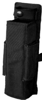
TIGER Padded SL2/CU2 Molle Vest Holster