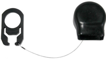
SBA Hose retention clip with second stage mouthpiece cover and lanyard, available in black or neon yellow