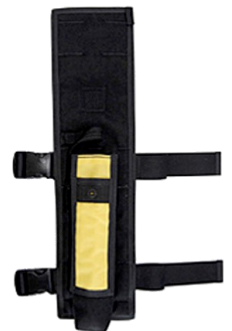
Leg Holster with Adjustable Leg Straps