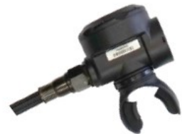
CU2 Second Stage regulator with 90° swivel Banjo hose. Also available with Hard Purge Cover