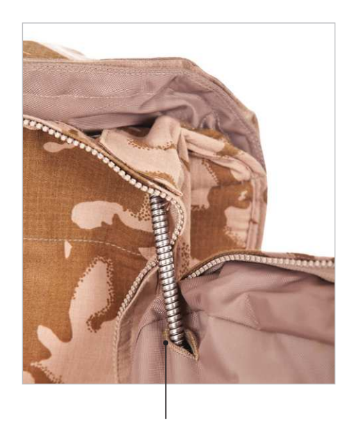
Operating lanyard conduit