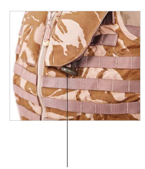
Operating pull hand/toggle