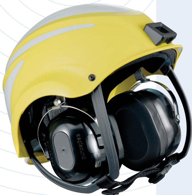
APC-2G with standard chin strap and Aegisound's MAX25 SHP Single Hearing Protection shown